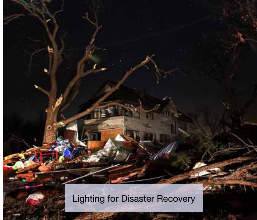
Lighting for Disaster Recovery