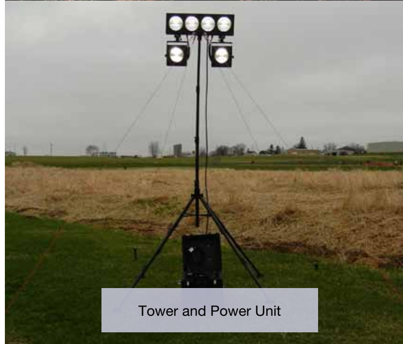
Tower and Power Unit